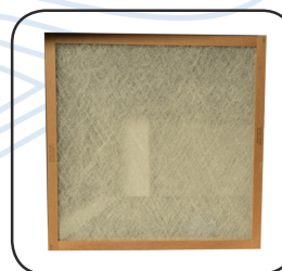
Protection Filter 20"x20" SKU:FVT2020