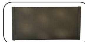
Charcoal Filter for Spay Booth SKU:FCFT