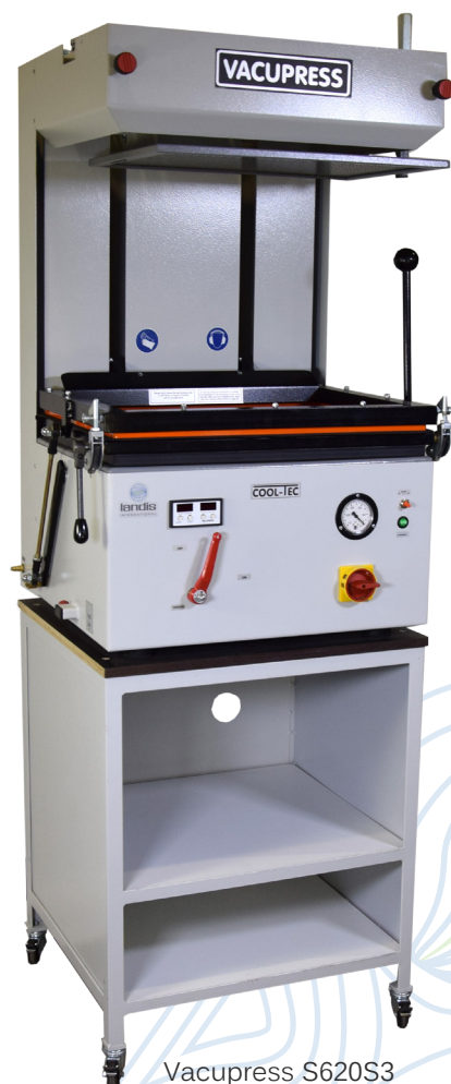
Vacupress S620S3 SKU: SUPREME620S3

The current version of the VACUPRESS 620 S3 deep-drawing-unit is equipped with the new developed COOL-TEC cooling-system. By use of adjustable special air jets materials can now be cooled automatically at the VACU-PRESS unit. Thus cooling duration is reduced up to 75%. Increase the productivity of your workshop by shortening the turnaround times!