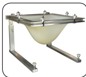
Bubble Forming Tray SKU: SETFR

The current version of the VACUPRESS 620 S3 deep-drawing-unit is equipped with the new developed COOL-TEC cooling-system. By use of adjustable special air jets materials can now be cooled automatically at the VACU-PRESS unit. Thus cooling duration is reduced up to 75%. Increase the productivity of your workshop by shortening the turnaround times!