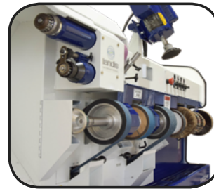
Adjustable sole trimmer

All Landis Finishers have a shaft bayonetted on both sides to interchange rapidly with our large variety of accessories.