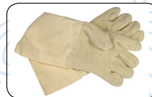
Protection gloves SKU: 20009