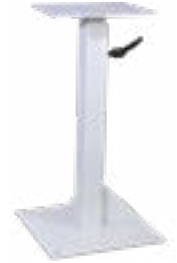
Adjustable stand SKU: MGP34BASEADJ