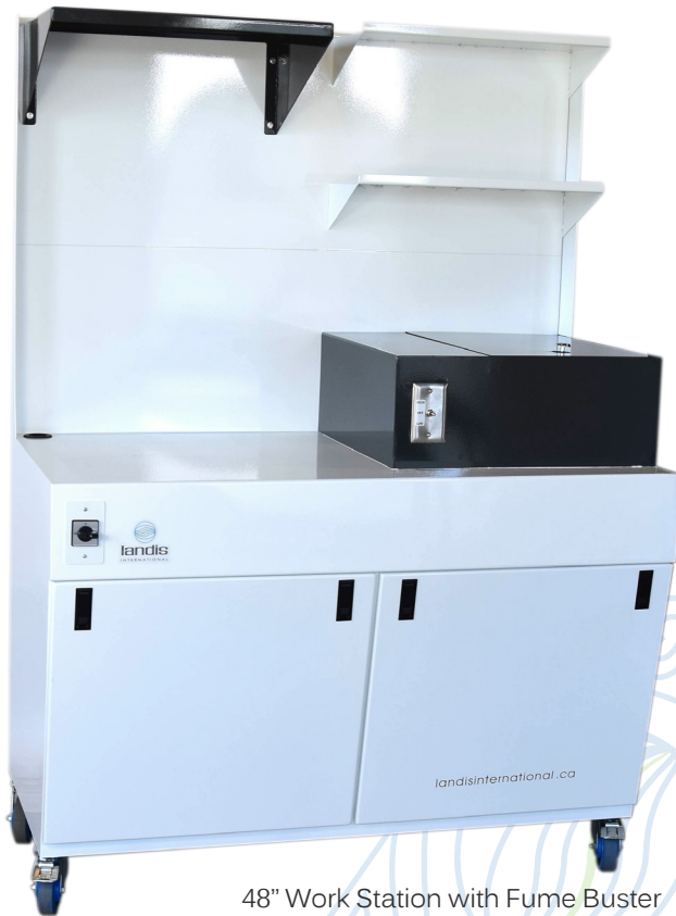
48" Work Station with Fume Buster SKU: WBHF48

Maximize your Work Space, Organize your Shop