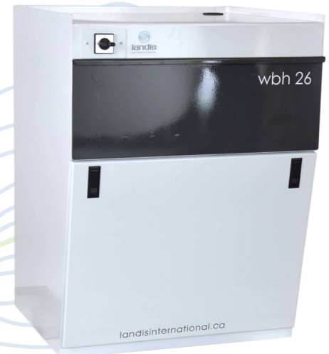
26" Work Station SKU: WBH26