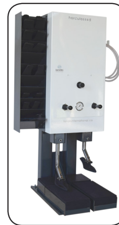
Hercules Double Space Saver Press SKU: HERCULESSSD

Landis Work Stations are providing organized working space. Ask for a quote with all the features needed